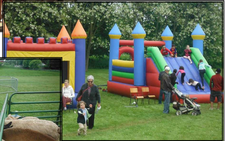
Family Fun Fair in June