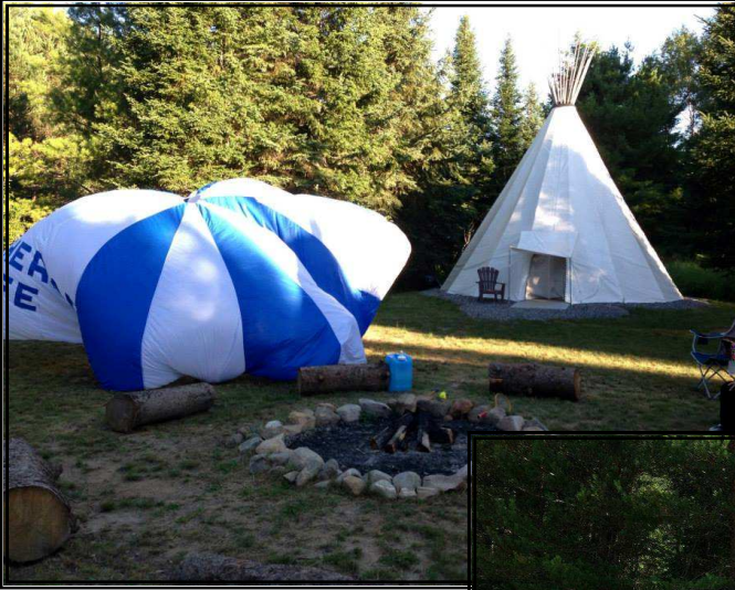
Tipi Camping in Muskoka in July