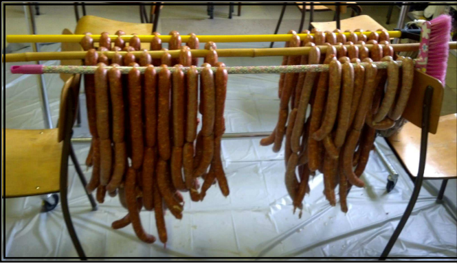
Sausage Making 101