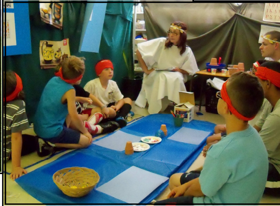
VBS Greece in July