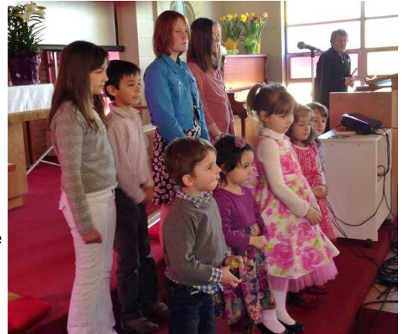
Children's Choir Easter Worship